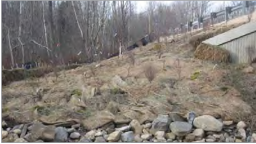
Erosion Control Blanket