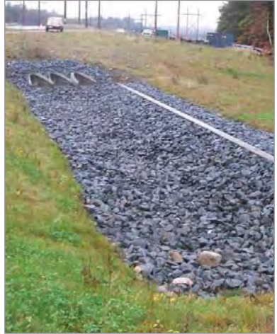
Level spreader adjacent to stabilized outlet