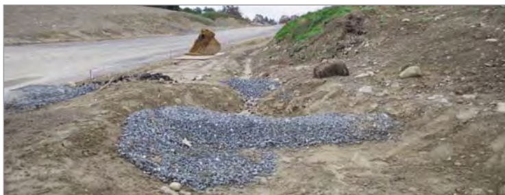
Stone Check Dams

Stone check dams act as containment structures that help slow the velocity of runoff in drainage ditches. They can be used during the construction phase of a project and/or left in place following construction where rip rap will be placed as the permanent channel stabilizing liner. Properly installed stone check dams can be very effective at reducing channel erosion and downstream sedimentation.