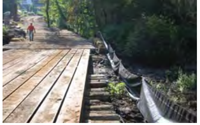
Swamp Mat Use Through Wetlands