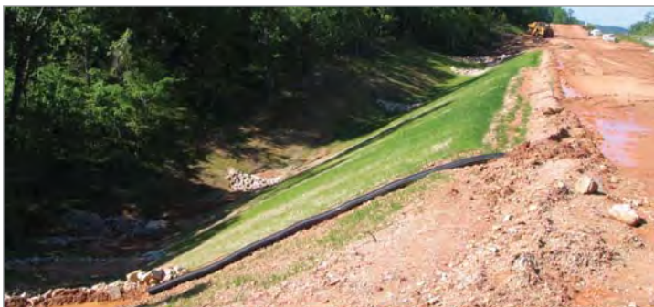
Temporary slope drains

A strong, flexible pipe, made out heavy duty, non-perforated corrugated plastic or metal, extends from the temporary diversion at the top of a cut or fill slope to a stabilized outlet or a sediment trap at the base of the slope. Diversions at the top of the slope are used to direct water to the drain to avoid development of gullies or channel erosion, or saturation of slide prone soils on disturbed surfaces. Temporary slope drains are most needed in the time between the construction of a cut or fill slope and installation of permanent water disposal methods. These types of drains can also be used on bridges to direct stormwater from the deck surface, vertically down the bridge pier, toward a stabilized splash pad.