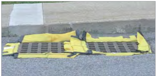
Silt bag drop inlet protection