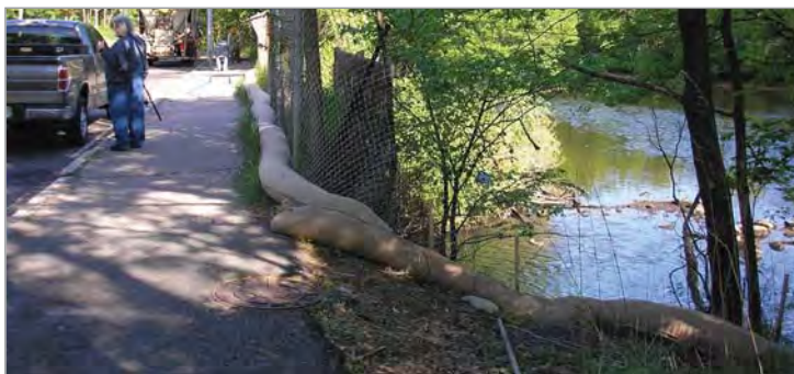
Compost filter sock