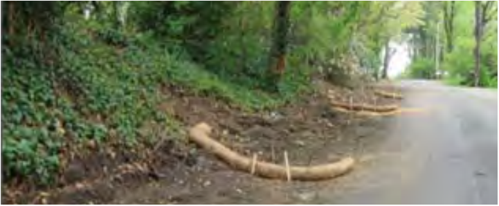
TDCs constructed with straw wattles

Spaced properly, Temporary Ditch Checks (TDC) can be very cost-effective and useful methods for reducing the velocity of flowing water in swales and shallow drainage channels. Reducing flow velocity helps to reduce channel scour and erosion, encourages sediment deposition and promotes infiltration where suitable conditions are present.