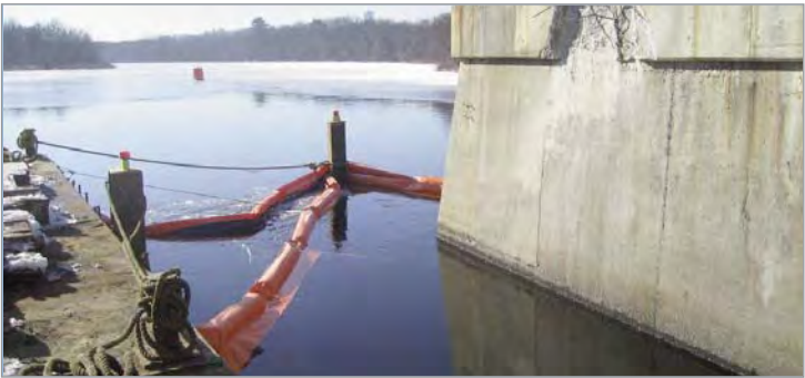
Floating Turbidity Curtain

Temporary flexible barriers used within a waterbody to separate or deflect natural flow around a work area. Barriers are placed around the source of the sediment to contain the sediment-laden water, allowing suspended soil particle to settle out of suspension and stay in the immediate area. Floating siltation barriers are often called silt or turbidity curtains, and can be purchased from manufacturers or constructed on site.