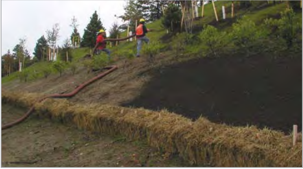
Typical straw bale barrier installation

Straw bales (not hay bales) can be used alone or in combination with sediment fence, depending on its intended function.