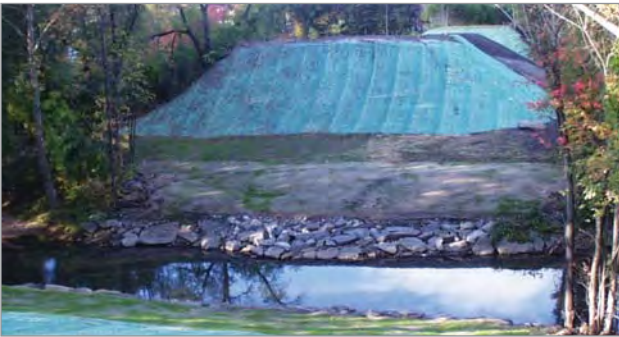
Erosion Control Blanket

TRMs are made from interwoven layers of degradable and/or non-degradable, natural or synthetic materials layered in a 3-dimensional matrix. TRMs can be used to permanently reinforce vegetation in drainage ways during high flows, or where erosion potential is high. TRMs serve as an intermediate BMP between hard armor (e.g., rip rap) and ECBs