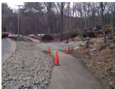
Stabilized Construction Entrance