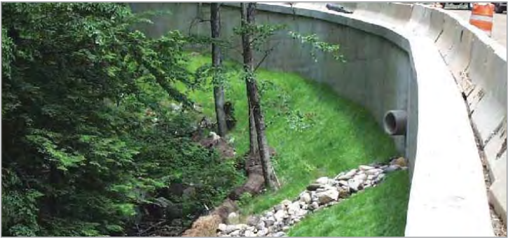
Riprap outlet protection at an outfall pipe

Measures designed to control erosion and scour at the outlet of a water conveyance structure, by reducing the velocity and dissipating the energy of stormwater flow. Also known as velocity dissipation devices, the outlet protection structures should be designed to handle the peak runoff from the 10-year storm. Outlet protection and velocity dissipation can prevent plunge pools and gullies from forming that may significantly weaken and undermine embankments and slopes. Outlet protection should be constructed early during the project-related activities, but can be installed whenever necessary. Outlet protection devices can include stone/riprap, TRMs, or other devices specifically designed to prevent scour.