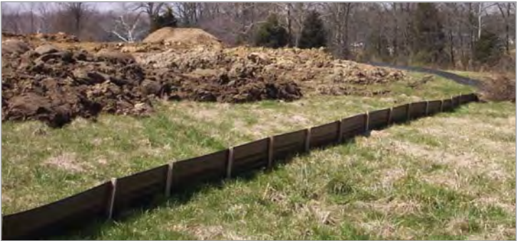
Typical sediment fence installation

Sediment fence (also referred to as silt fence) can be used along or in combination with other BMPs (e.g., straw bales, wattles, etc.) depending on its intended function. Reference MassDOT Standard Special Provision Section 670 for additional product and installation requirements.