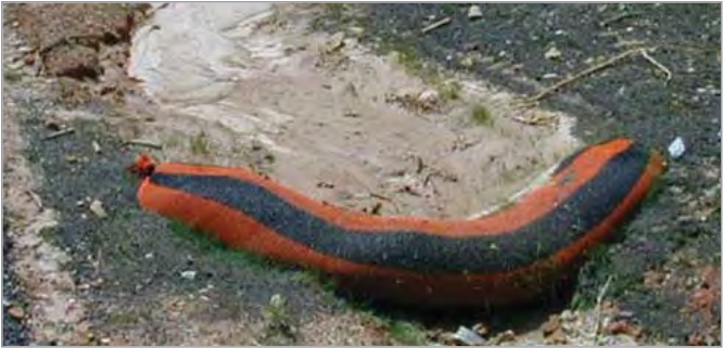
Fiber rolls installed as a ditch check