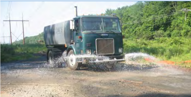
Water sprinkling used for dust Control