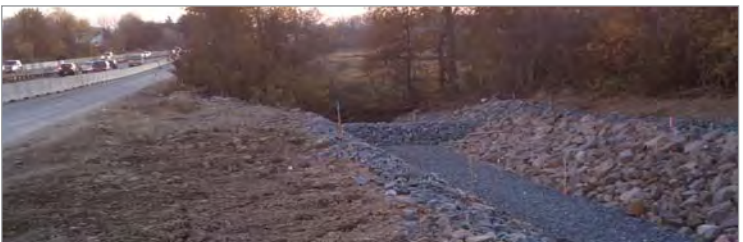
Stone Check Dams