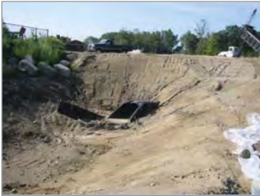
Temporary sediment basin