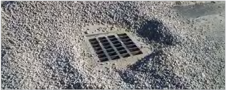
Stone mound inlet protection