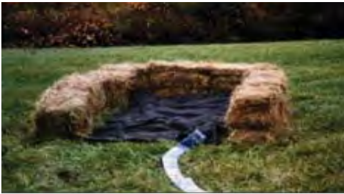
Filter bag & straw bale dewatering area