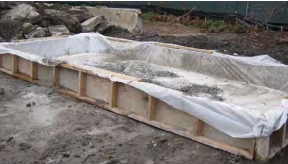
Example of a concrete washout area