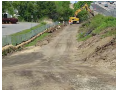
Construction haul road