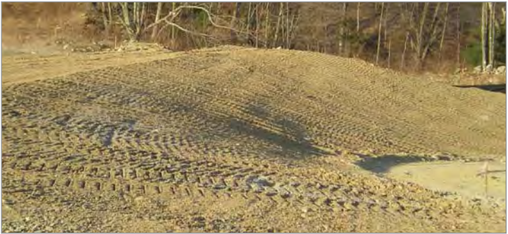
Soil roughened with tracked machinery

Roughening a bare soil surface with horizontal grooves running across the slope, stair stepping, or slope tracking with track-mounted construction equipment is a technique that can reduce runoff velocity, encourage rainfall infiltration, reduce erosion, and facilitate sediment trapping.