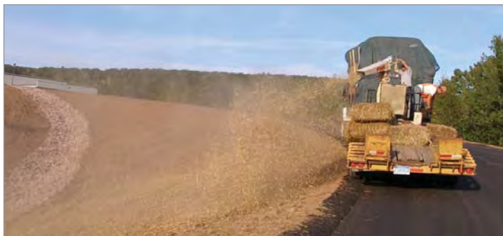
Straw mulch application

Straw and hay mulch are lightweight, biodegradable and pH neutral. They are effective for moisture retention, but hay mulch can be contaminated by “weed” seeds. Reference MassDOT Standard Special Provision M6.04.01 for Hay Mulch and M6.04.02 for Straw Mulch material specifications. Mulch shall be placed according to MassDOT Standard Specification 767.1.