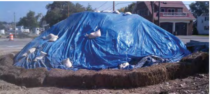
Plastic Sheeting on Stockpiles