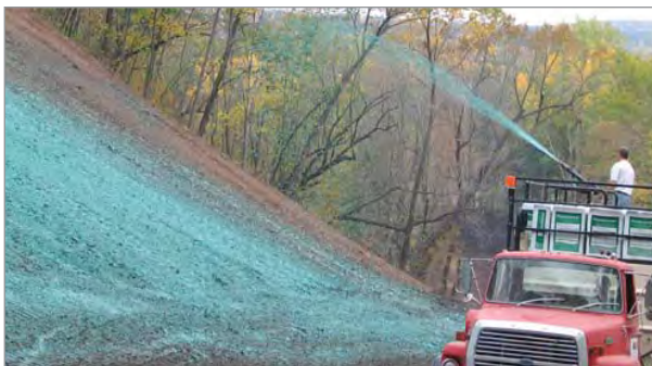
Paper-based mulch

Wood fiber and paper mulches are biodegradable and exhibit good moisture retention and weed control. Because the decay of freshly produced wood chips from recently living woody plants consumes nitrate, careful consideration should be given to offsetting such nutrient consumption by wood mulch with other nutrient sources (e.g., fertilizers, seed mixes with nitrogen fixing plants, etc.) in order to help establish vegetation. Wood and paper mulches should be used in combination with a soil and mulch binder (See E.3 Soil and Mulch Binders), or another erosion control product that will help provide additional erosion protection (e.g., ECB, TRM, etc.). Reference MassDOT Standard Special Provision M6.04.03 for Woodchip Mulch and M6.04.04 for Wood Fiber Mulch for material specifications.