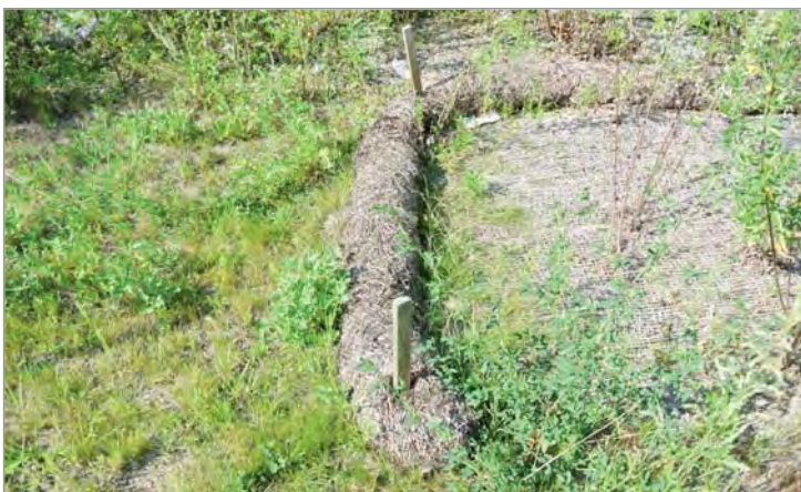
Straw wattles

Because most biorolls are 100% bio- or photodegradable, they do not typically need to be removed from the site at the end of the project. However, it is important to confirm the product's specified functional longevity in order to ensure that it will function throughout the duration of construction, but will not last far longer than is necessary (i.e., several months past project completion).